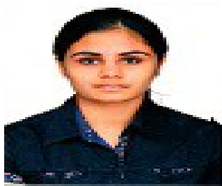
16SJCCC115 ATHIRA UK (SPGA 8.90)