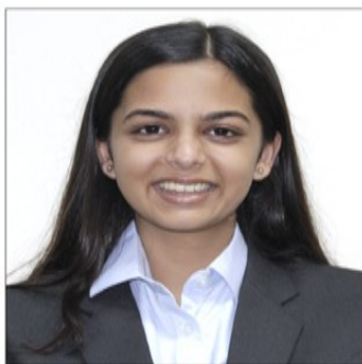
18SJCCB137 DHITING G (SGPA :8.88)